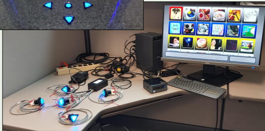
Design, Proof of Concept, Testing