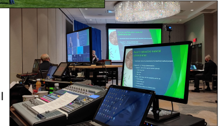
Live and Virtual Meetings