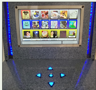
Interactive Museum Display