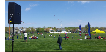
Outdoor Sound System