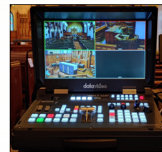
3 Camera Streaming System